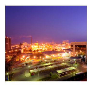
Tronox Yanbu Complex The Gulf Titanium Co. Ltd. Kilo 21, PO Box 30320 Yanbu Al-Sinaiyah 41912, KSA