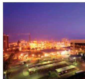
Tronox Yanbu Complex The Gulf Titanium Co. Ltd. Kilo 21, PO Box 30320 Yanbu Al-Sinaiyah 41912, KSA