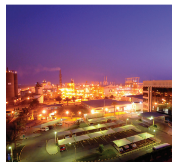
Tronox Yanbu Complex The Gulf Titanium Co. Ltd. Kilo 21, PO Box 30320 Yanbu Al-Sinaiyah 41912, KSA