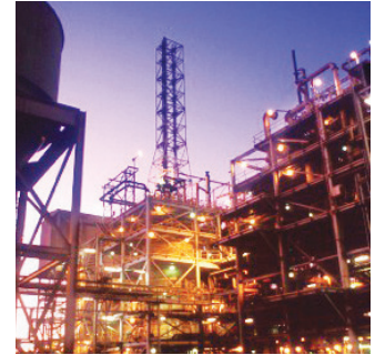
Kemerton Plant 869 Marriott Road Kemerton Industrial Park, Australia