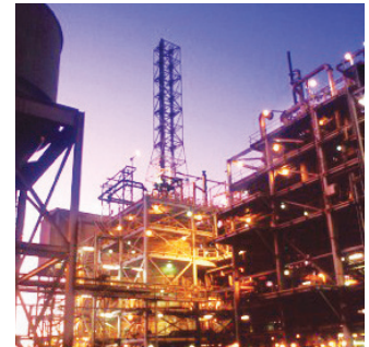
Kemerton Plant 869 Marriott Road Wellesley WA 6233