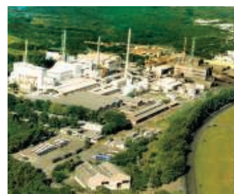
Rodovia BA 099, km 20, Abrantes Camaçari, BA. CEP 42840-000 Brazil