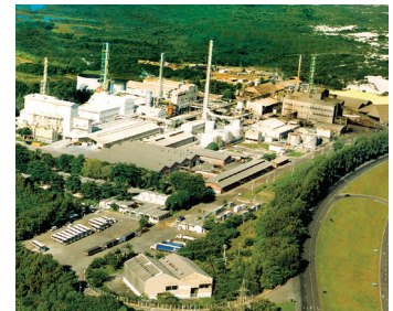
Rodovia BA 099, km 20, Abrantes Camaçari, BA. CEP 42840-000 Brazil